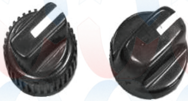
MKN 27.0001 & 2