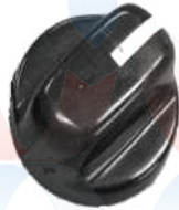
MKN 27.0001 & 2